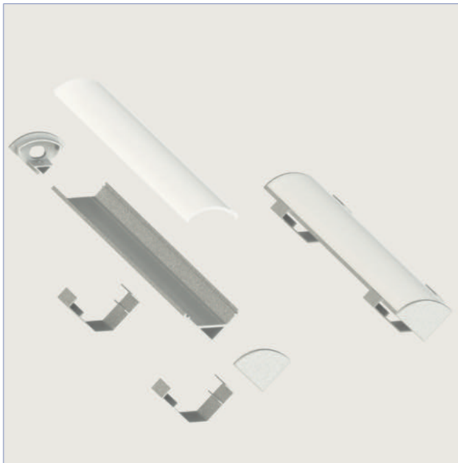
Paris - LL-0725-8