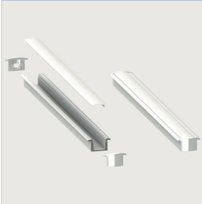
TOKYO - LL-0746-8